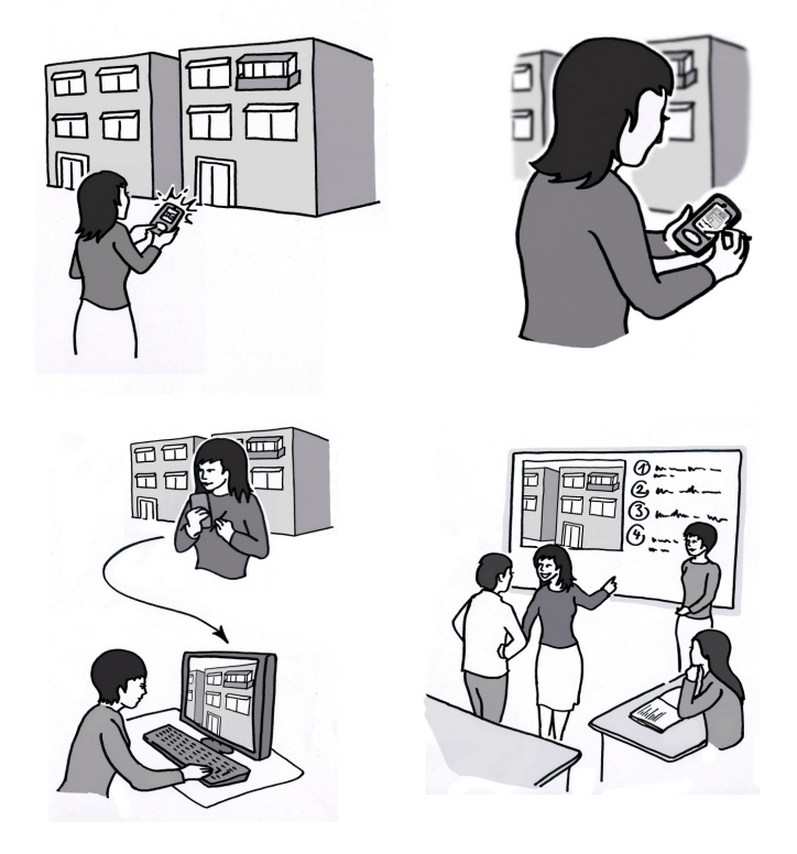
Figure 2 (illustrated by Gabriele Heinzel): A student notices an interesting case of appropriation and takes a picture (a). She adds notes creating a pattern proposition (b). She sends her rough pattern proposition to a friend for commenting and adding input on a PC (c). At home she elaborates upon her observations to present her proposition. In class it is discussed on the whiteboard (d).

(13) Edit pattern library by linking or deleting patterns