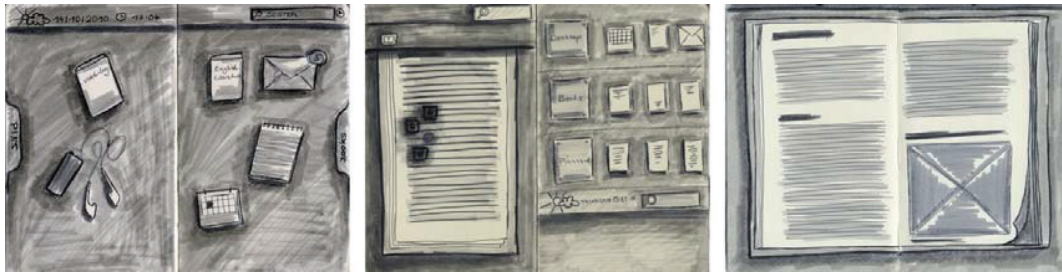
Figure 1. Different sketches of the interface. View on the table, some files and an opened book, ready to read.