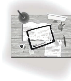
Figure 2. Scanning documents

Two screens would offer additional possibilities to arrange one's documents on the device. Two documents can be displayed next to one another or an opened page takes up both screens for a better picture by turning the device vertically. To prevent unwanted changes of the display detail when holding the device (for example for a quick change of the seating position on the bus), the display detail can be fixed by pressing a key. This option is also necessary when working on documents in a certain position. In order to synchronize documents of all kinds as well as the learning environment, e.g. one's study desk with the iDesk, the method of visual search is employed (a more simple initial version may apply barcodes). Documents or even entire shelves can be scanned. These data are filed away, identified and transformed in form of photos on the iDesk so that they can be worked with further on. A usage scenario illustrates how to work in such an environment.